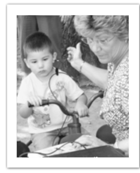
Figure 3 Trainee Learning to Screen in a Natural Setting

Monitoring program quality. Similar to hospital-based screening efforts, there are a number of ways that Early Head Start program staff can be encouraged by EHDI professionals to monitor the quality of their screening programs. (Additional resources can be found at kidshearing.org/resources/track).