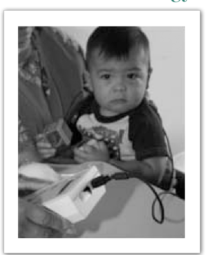
Figure 1 Child Being Screened Using OAE Technology

When screening infants and toddlers 0–3 years of age for hearing loss, OAE is usually the optimal tool, because it does not require a behavioral response from the child and is quick, painless, portable, and reliable (see Figure 1). Audiometry has traditionally been the preferred method for screening older children who are developmentally mature enough to respond to instruction and provide a consistent behavioral response. There are, however, many children 3-5 years of age who have developmental delays or difficulty following directions and are therefore unable to complete pure-tone audiometric screening. Thus, for a large percentage of young children, OAE is the most reliable screening method. A 6-minute video introduction to OAE screening can be found: kidshearing.org/ videos/IntrotoOAEScreening